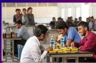
VEG & NON-VEG FOOD